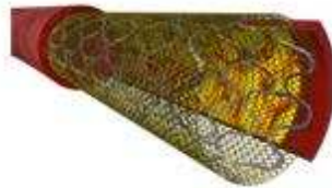
MGuard™ Deployed in Artery

The protective sleeve is designed to provide several clinical benefits: